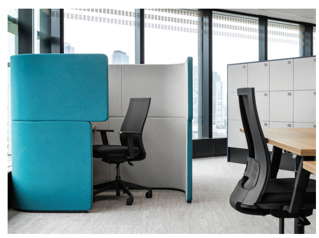
Focus Booths, Palette Chair and Vecos Lockers

The signature Infosys blue winds subtly throughout, and pops of yellow and dusky pinks in Schiavello furnishings guide people towards quiet chairs, focus booths and team collaboration areas. Natural finishes soften the space and are a physical embodiment of the stringent sustainability approach that underpinned material choices.