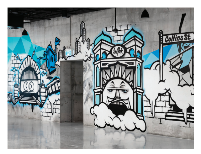
Street Art Murals

and give the global office a distinctly "Melbourne" feel.