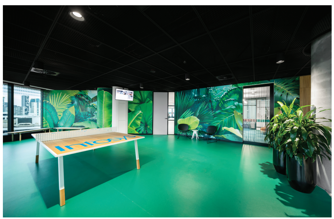
Breakout and relaxation spaces

"We have a long-term commitment to ongoing support," Tigani explains. "We don't just provide a solution and walk away. When we collaborate so closely, we are fully invested in ensuring the workplaces we co-create remain inspiring, beautiful and functional for years to come.