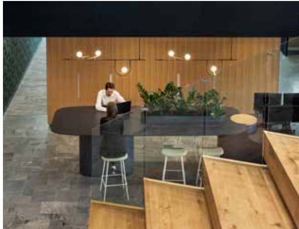
Agile Custom Table

Bene Think Tanks are scattered throughout the levels in response to the need for quiet in an open-plan office without creating 'fixed or permanent' spaces. Their flexibility and reconfigurability allow the ANZ team to customise how they are used.