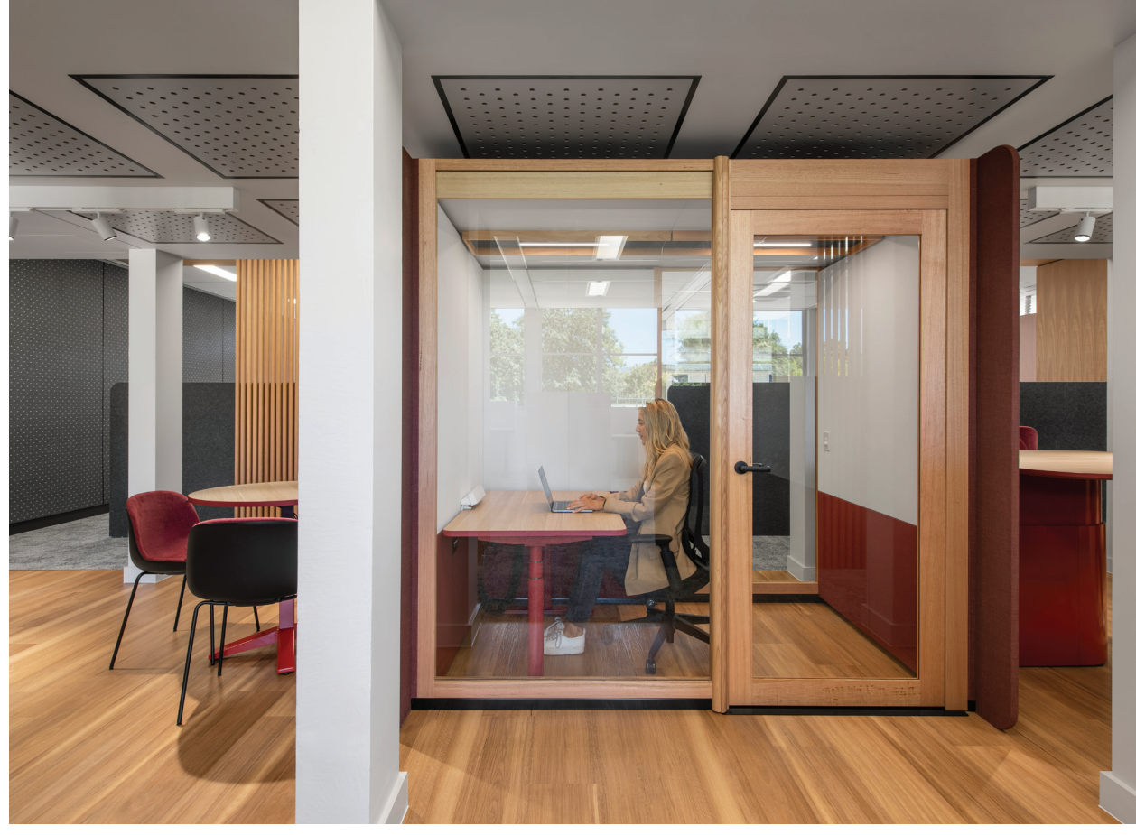
Focus Quiet Work Room