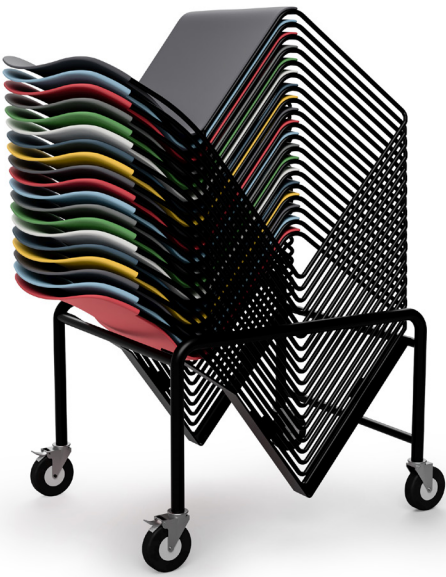
Dedicated Trolley (Stacks up to 10 chairs on floor/up to 30 on trolley)