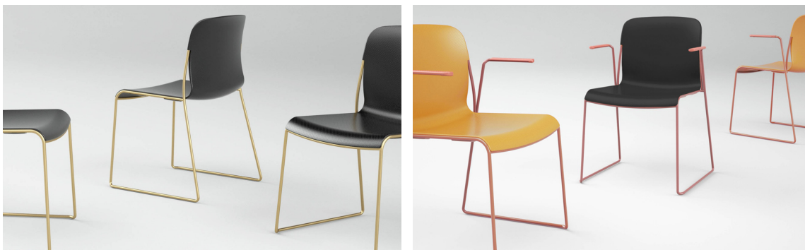
Brass Finish Option