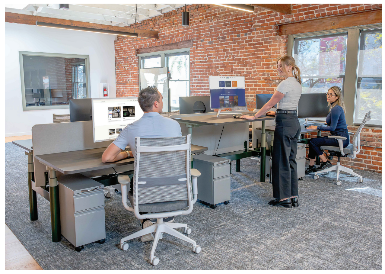
Krossi Workstation back-to-back cluster of six