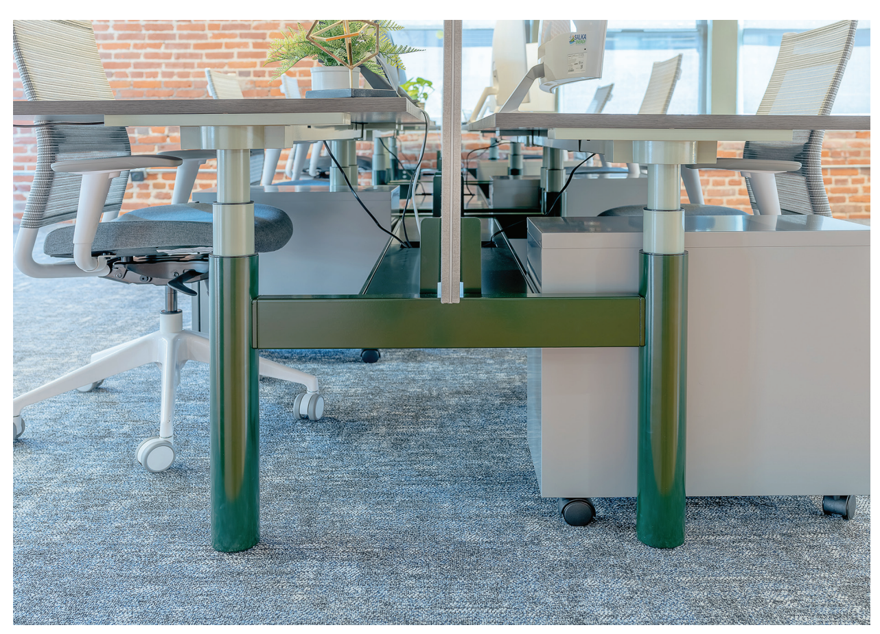
Krossi Workstation two-toned leg powder coated in Fir Green and Silk Grey

Interior design by THINK Office Interiors