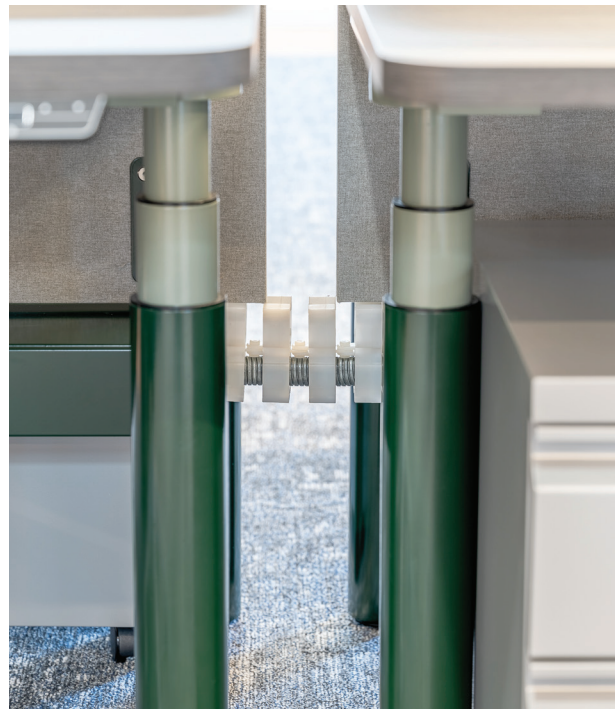
Krossi Workstation with articulator for ease of movement

"The client wanted to bring some colour into the space, whilst still being respectful of the beautiful building and its original character. Schiavello's two-tone Krossi Workstations fit this brief, as the wide range of finishes available meant we could design and tailor workstations to perfectly suit the space."