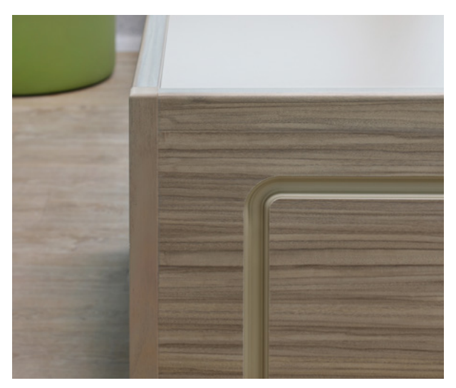
Custom laminate bed base

prevent injury from sharp edges. Fixed to the floor via metal brackets, the robust base comprises a series of interlocking panels, to brace it against any side or top impact.