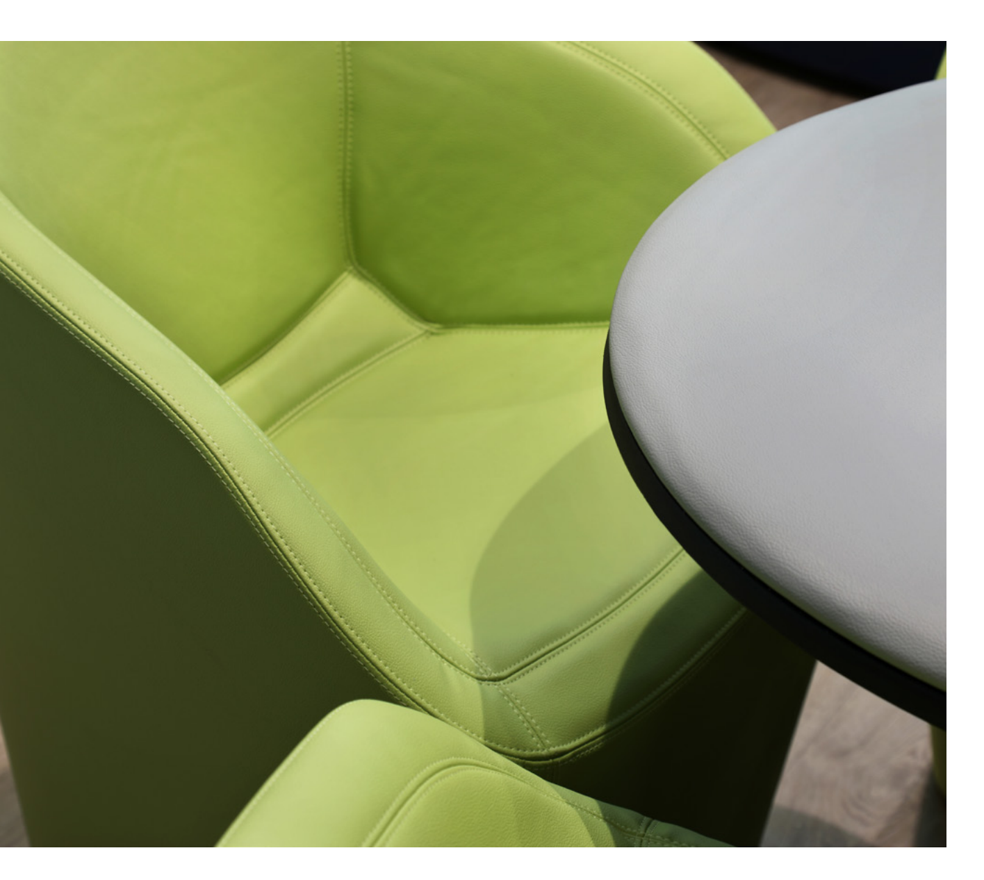
Safety Through Sensitivity: Designing for Behavioural Health at Joan Kirner -