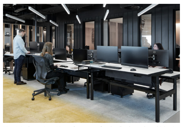
Neo Workstation, Kase Storage, Cache Pedestal and Monitor Arms

This is just the beginning of the similarities between Kane and Schiavello. Both are Melbourne-based institutions that have thrived over decades by fully understanding and adapting to individual project needs as well as evolving trends in the ways people engage with the spaces around them. This future focus is not only a value reflected in Kane's everyday business activities; it is now physically embodied through the design and fit out of its space.